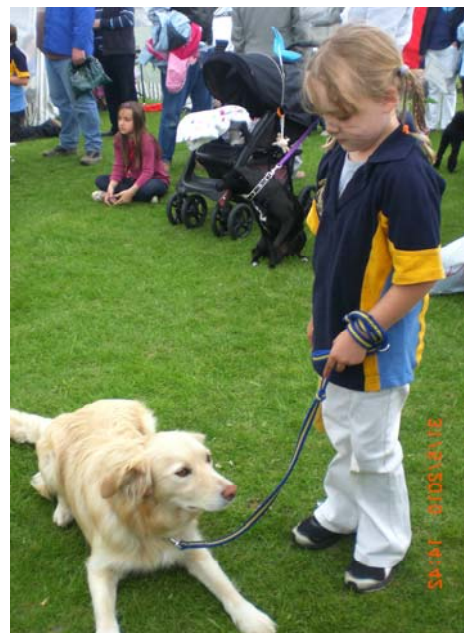
GioGio and Fuzzy, one of the Many Tears Rescue dogs now with WDTTC members