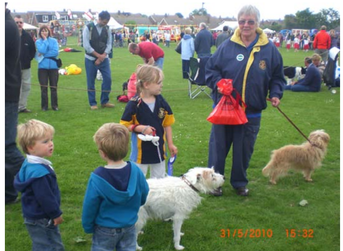
The young and not so young members of Wallingford Dog Training Club at Harwell.