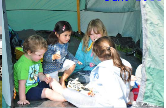
It must be Lovington's!