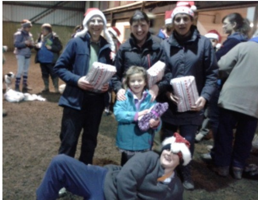
Above: Christmas Party winners: Well Done Yellow Team! Below: The Green Team very pleased with the wooden spoons!