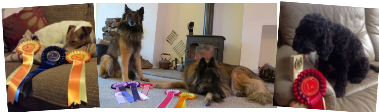
Above: a tired Mylo, Mischief, Gimli and Sky with a tasty trophy – look at that tongue!

There were also a further 7 dogs running only in Anysize, which does not contribute points to the final score.