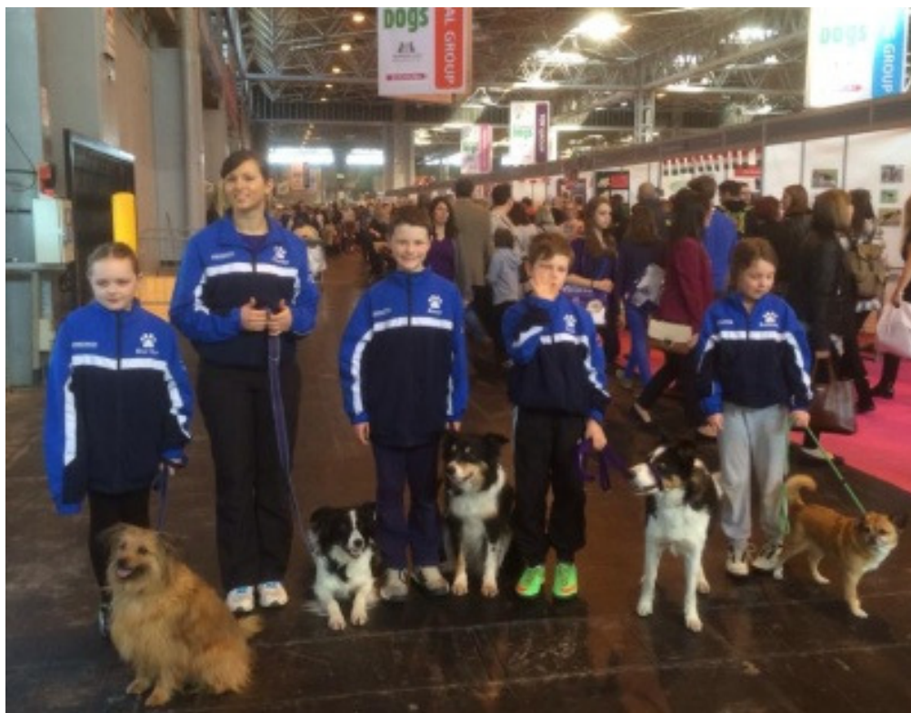
Above: Wallingford Juniors Team at Crufts 2014