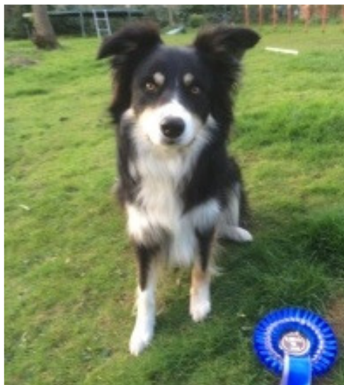
Above: Sonic and his first ever rosette