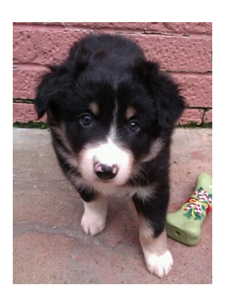
Right: new Tidmarsh puppy Sonic