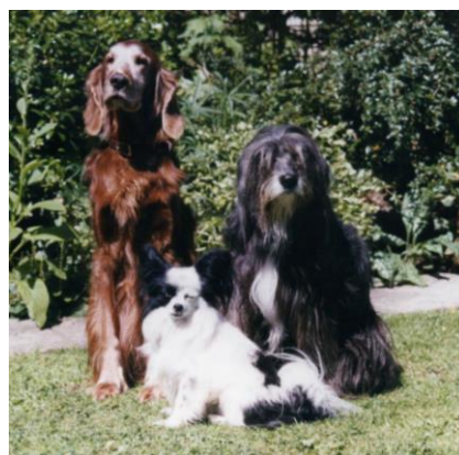
Right: Amun, Kiki and Zoltan

Next Poppy (a small, failed hearing dog for the deaf of mixed pug / papillon parentage) and Pera (the Terror! – an unwanted stray) joined the clan, followed most recently in 2014 by Zou Zou.