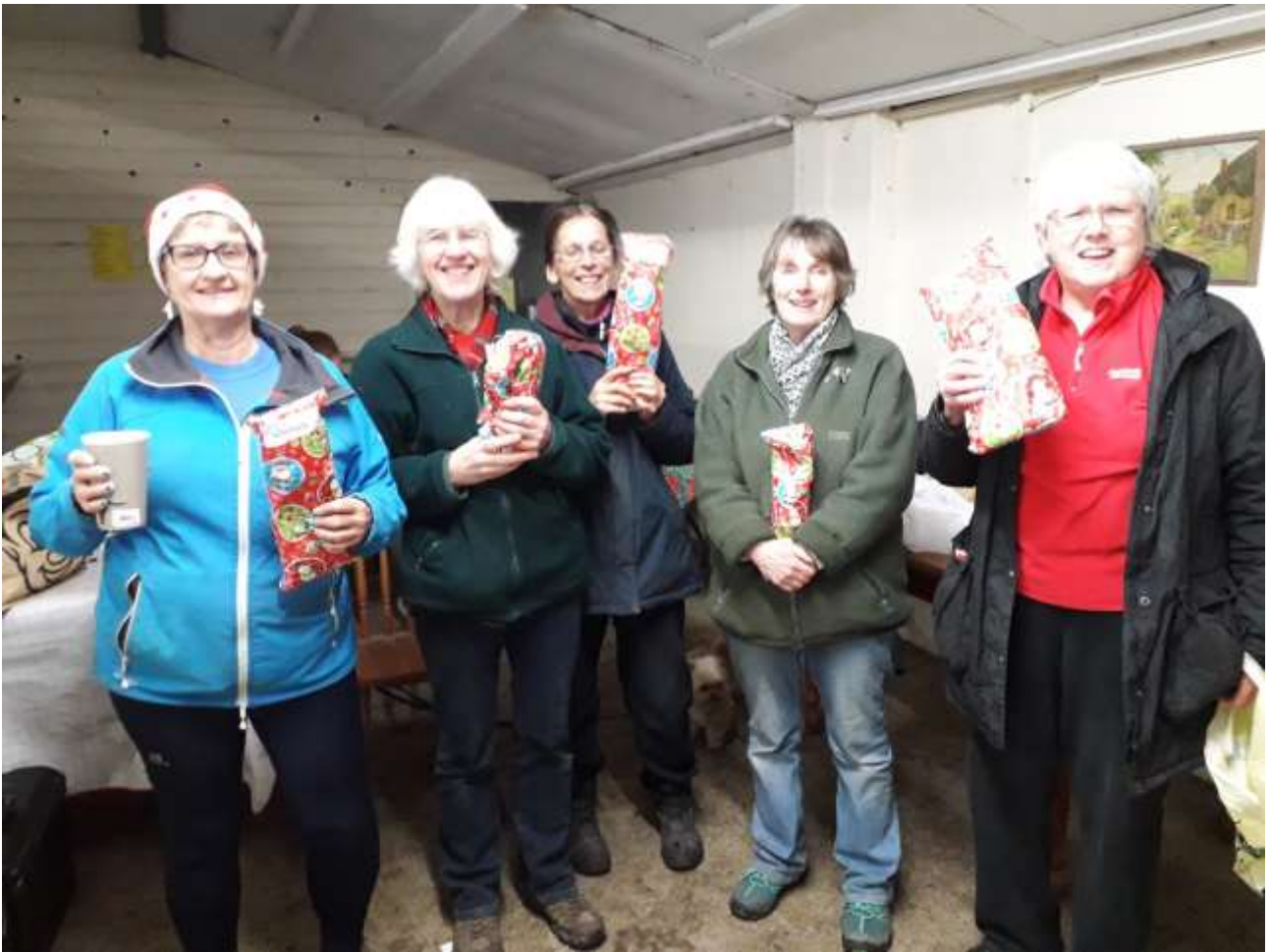
Winner – Blue Team