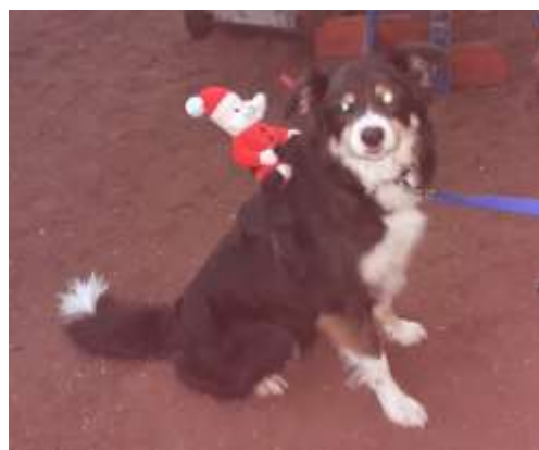
Sonic and Santa