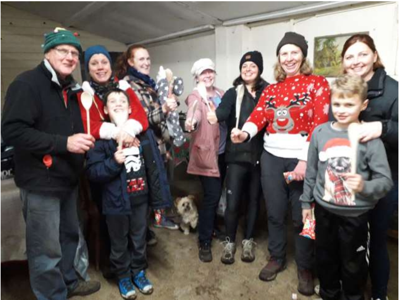
Wooden Spoon – Yellow Team