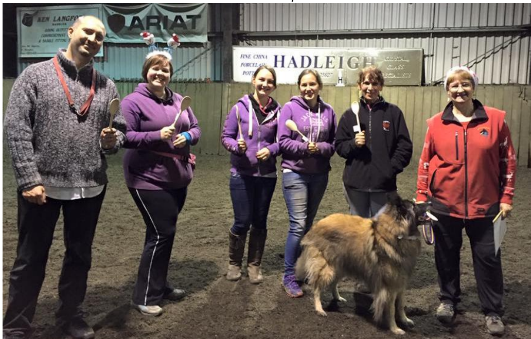
Below: the wooden spoon team....