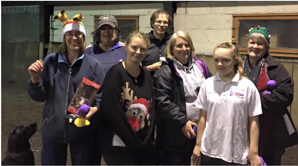
Above: the Purple Team – the winners!