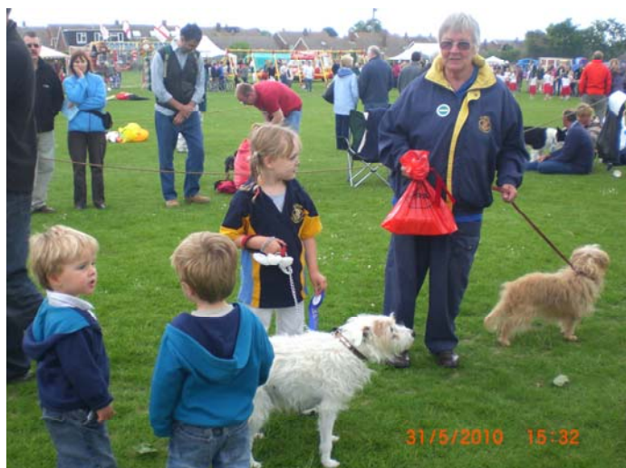
The young and not so young members of Wallingford Dog Training Club at Harwell.