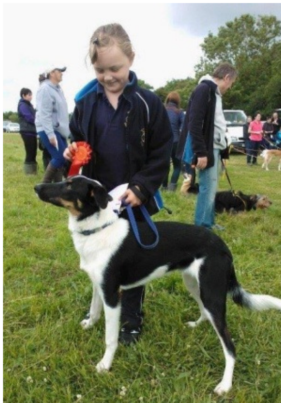
Right: Gio-Gio with Arthur winning Most Handsome Dog at NAWT Open Day