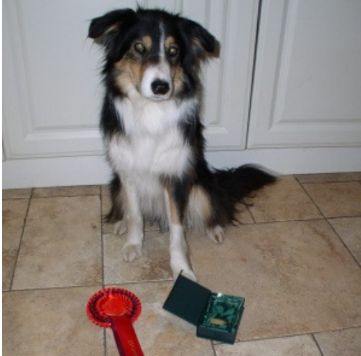
Above: Mickey wins G3 Jumping