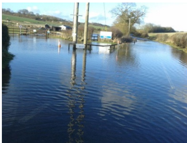
Right: The flooded main road and entrance to Trindledown Farm.

The centre has been closed to the public since 7th February, as it became unsafe to drive in and out. Local roads are still flooded, and for several days the main A338 was completely closed through the village of Great Shefford due to the water levels. Neighbouring villages of Eastbury and Lambourn also had some flooding; many residents have not yet been able to return home, and one of my colleagues who lives in West Ilsley still has a Portaloo at the end of her drive.