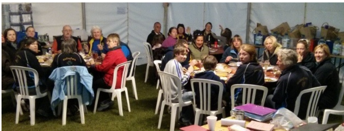
Above: Helpers' supper on Saturday evening at the show