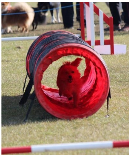
Left: Foxie in flight