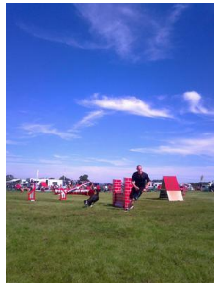
(Above: Gillingham Champ class)