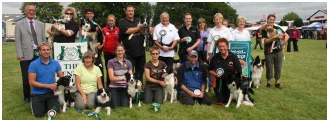
(Above: the qualifiers from the second Novice Semi Final)

My running order was 33. I had walked and walked the course deciding my handling options. We were on the line – and then it was over. We finished with 5 faults (up on the dog walk) and then had to wait for the last 9 dogs to run to see if it was good enough! We finished 14th out of the 18 to qualify! Here's a link to the run on Youtube if you want to compare our run to the analysis http://www.youtube.com/watch?v=YgQppCDX5Rg .